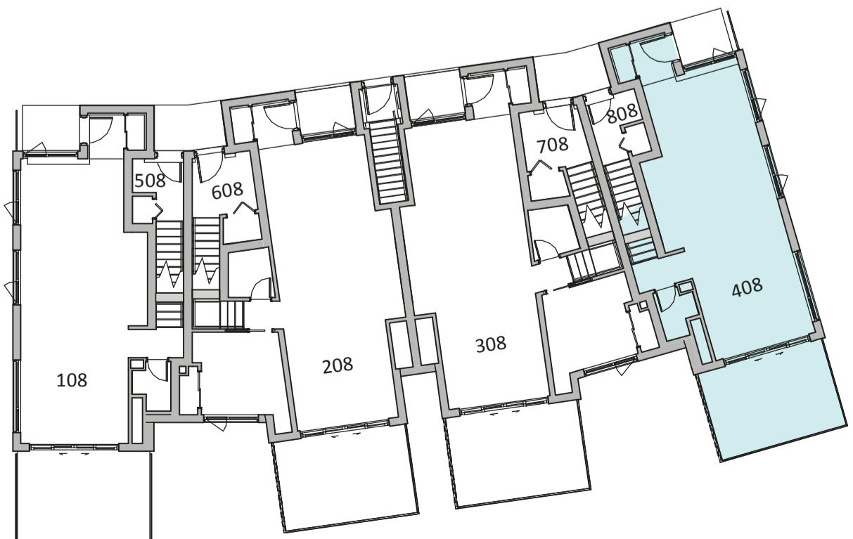
NIVEAU 2 | LEVEL 2