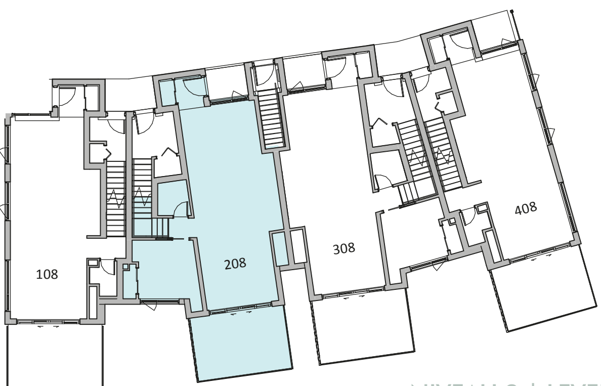
NIVEAU 2 | LEVEL 2